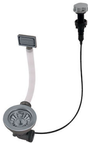
Gun Metal automatic waste fitting - PG 8407 110