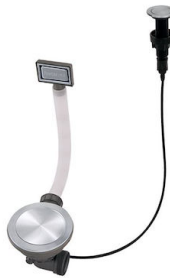
Space Push automatic waste fitting - PP 8407 116