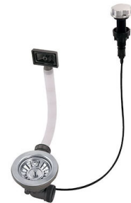
Automatic waste fitting 8407 000