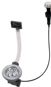
Automatic waste fitting 8407 100