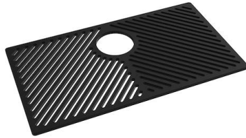
Griglia Black 8100 653