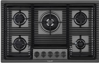
Cooker hob Milanello Gun Metal 5F 7682 006